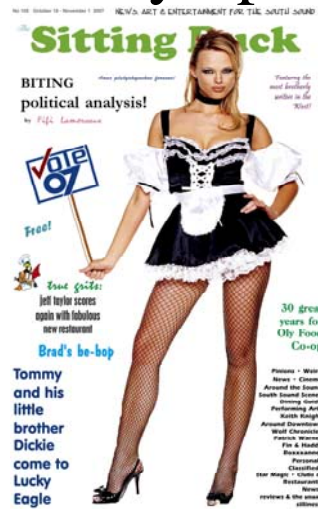
Actual Front Cover of the Sitting Duck Newspaper published October 18 th , 2007

Has it ever bothered you that news stories about sexism, people of color and marginalized people are absent from the front page of your local Olympia and Pacific Northwest progressive and corporate newspapers?