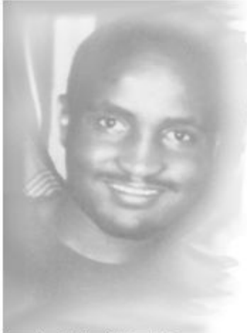
Amadou Diallo 1975 - 1999

This website is neither affiliated with the authors of the below information nor responsible for its content. This website is neither affiliated with the authors of the below information nor responsible for its content.